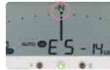
Support tuning to major/minor thirds (just intonation)