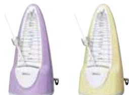
Lavender Purple(LV) Pastel Yellow(Y)