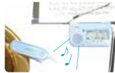
Reference tone like a Clarinet sound