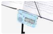
Slit convenient to attach to music stand