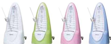
White(W) Lime Green(G) Cherry Pink(C) Sky Blue(M)